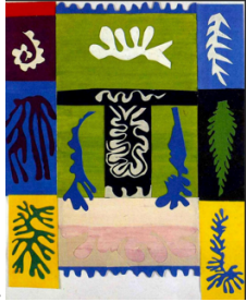
Henri Matisse: "Organic Shapes"

Organic shapes: Shapes that resemble those found in nature, such as those of plants and animals